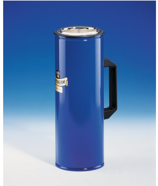
Dewar flask G 9 C