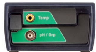
Connections on pH Vio