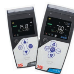
Conductivity meters and multiparameters