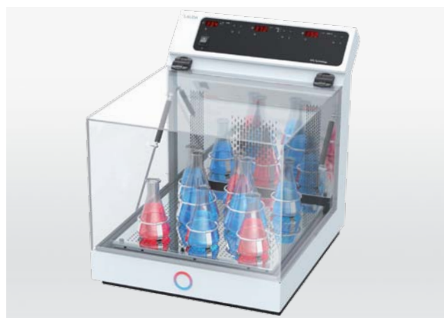
Varioshake VS 60 OI – compact, economic, powerful