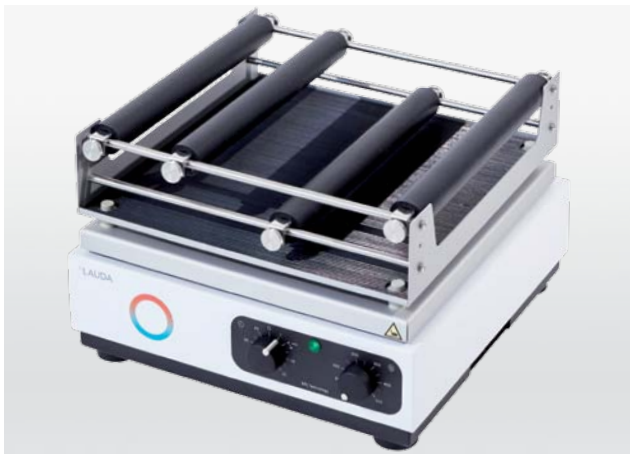
The robust entry-level shakers with analog controls – Varioshake VS 8 OE and VS 8 BE