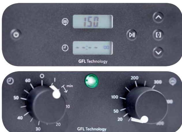
With digital or analog controls – intuitive and reliable

Simple and compact or robust with several shaking levels: LAUDA Varioshake shaking incubators are specialists in mixing and shaking with exactly reproducible circular movements and temperatures up to 70 °C. They offer comprehensive functionality and optimum temperature distribution throughout the chamber.