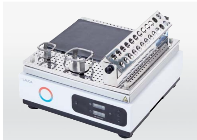
Modern digital controls and extended range of functions – Varioshake VS 8 O and VS 8 B